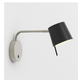
CODE: 1444005 FINISH: MATT NICKEL