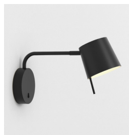
CODE: 1444004 FINISH: MATT BLACK