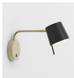
CODE: 1444006 FINISH: MATT GOLD

TO MAINTAIN THIS PRODUCT TO ITS BEST CONDITION, PLEASE VIEW OUR CARE AND CLEANING GUIDE ON THE SUPPORT SECTION OF THE ASTRO WEBSITE.